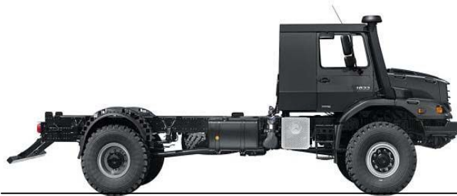
Zetros 1833 A*