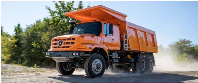
Mining and energy sector