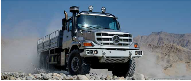
Transport and construction

The Zetros can be deployed in diverse scenarios.